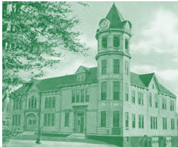
The Town Building circa 1896.

windows. A flag-topped dome originally crowned the rounded corner, and the building housed the Star Theater, the town's first movie theater. Guttled by fire in 1917, the block was rebuilt, with the same façade.