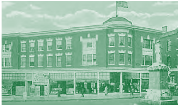
The Salomon Block circa 1917. The Civil War monument was moved to the Glenwood Cemetery in the 1950s.

The spire on the METHODIST CHURCH (21) was the first of Littleton's many spires. (The steeple on the earlier Congregational Church had a flat roof.) Built on the site of a tavern, the church with Doric columns on its Greek Revival portico was dedicated on January 8, 1851. In the 1880s, the Methodists renovated most of their churches by jacking up the sanctuaries and putting in ground-level meeting halls. This happened here in 1888, when a pilastered façade and Palladian window replaced the original portico. The Methodists had been meeting in Littleton since 1800, but this was their first permanent home.