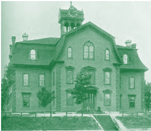
Littleton High School, circa 1930.

After four attempts over nearly a century, a permanent public library was established in 1890. From rented quarters in the ROUNSEVEL BUILDING (#17) , it moved to the new Town Building in 1895, and then in 1906 to the present LITTLETON PUBLIC LIBRARY (8) , a Carnegie bequest. To meet Andrew Carnegie’s conditions, the Town pledged $1,500 per year for operations and secured land for the building. Carnegie bequeathed $15,000 for construction, which was completed in 1906. The library houses the Kilburn collection of White Mountain art and the world’s second largest collection of Kilburn stereoscopic views. Visually, the building presents an eclectic blend of Georgian and neo-classical styles—decorations of a richness ambitious for a structure of moderate size.