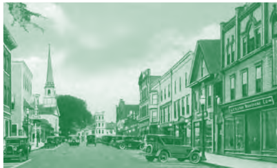
Main Street in the late 1930s, looking east. The Brackett Block is at right.

On the northern corner of Mill Street is Main Street's oldest commercial building, THE BRACKETT BLOCK (13) (In local usage the word "block" may refer to a single building rather than individual properties between two streets). Named for the Brackett brothers, William (1785–1859) and Aaron B. (1797–1868). Traders in general merchandise, they constructed the block in 1833 of timber harvested in the village and shaped by an Ammonoosuc River sawyer. The street level resembles its original aspect. The third floor was