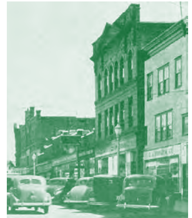
The Chutter Block, second from right, in the 1940s.