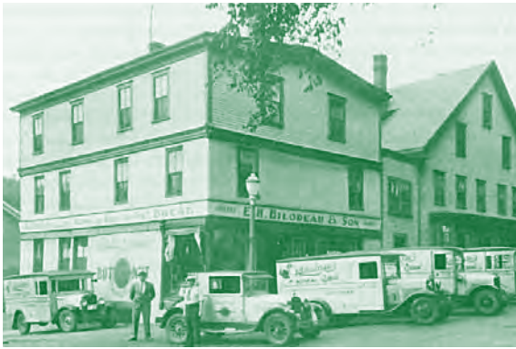
Bilodeau's Bakery in the 1930s.

In the 1930s, to grab the attention of motorists, a new, eye-catching architecture evolved, exemplified by the “diner car” restaurant. A 25-seat “parlor car” appeared on the site of THE LITTLETON DINER (2) in 1930, to be replaced in 1940 by this Sterling Diner, a stainless steel classic manufactured by the J.B. Judkins Company of Merrimac, MA.