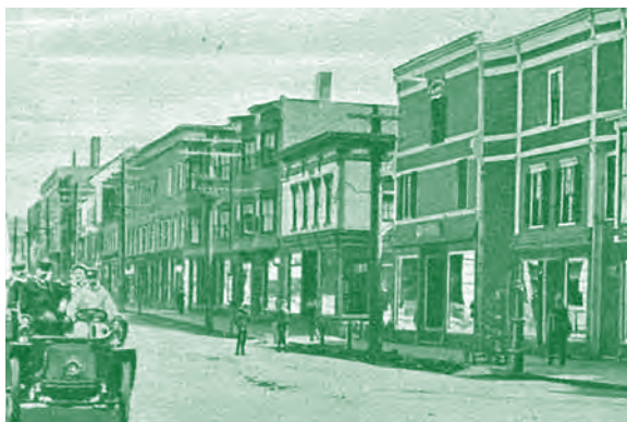
The Bugbee Block (center), circa 1910.

1898 Extract from a letter written by a visitor. —Picturesque and Progressive Littleton and the White Mountains