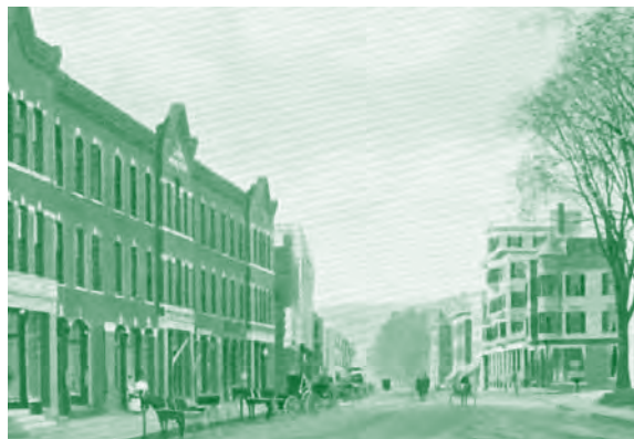
Main Street looking west in 1909.