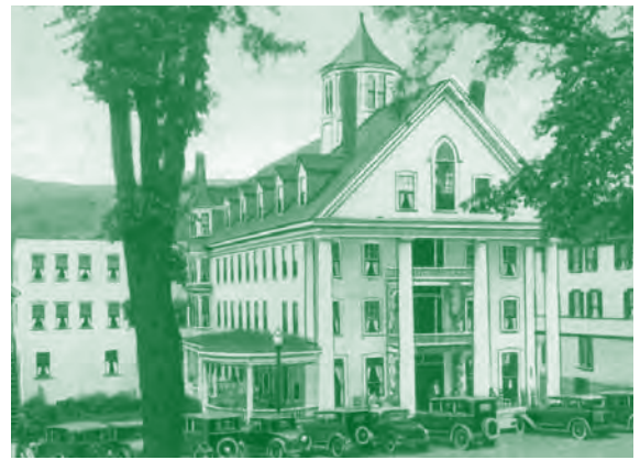
Thayers Inn in the 1930s.