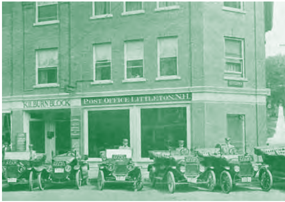
The Kilburn Block with postal delivery vehicles in 1920.

keen appreciation for visual detail is no doubt responsible for the building's "modillions"—ornamental brackets under the corona of the cornice—and other tasteful design elements. It housed the Post Office until 1935.