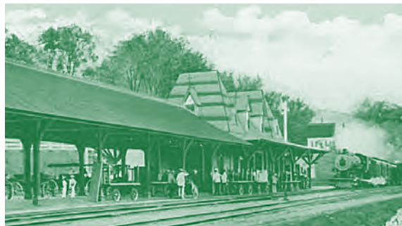
Littleton's Boston & Maine railroad station, circa 1900.

the memorial, which was funded by hundreds of individuals and businesses. Upstream may be glimpsed factory structures—the descendants of the 19th century "Scythe Factory Village." Downstream are the Littleton Grist Mill and Riverwalk Covered Bridge .