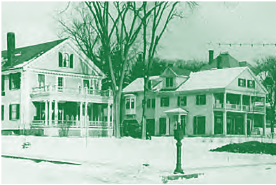
The grand residences of Doctors Beattie and Moffet stood at the corner of Main and Maple Streets, now site of the Post Office and Courthouse.

the architect to evolve a handsome exterior reflecting a century of Main Street motifs. The cost of construction was $265,000.