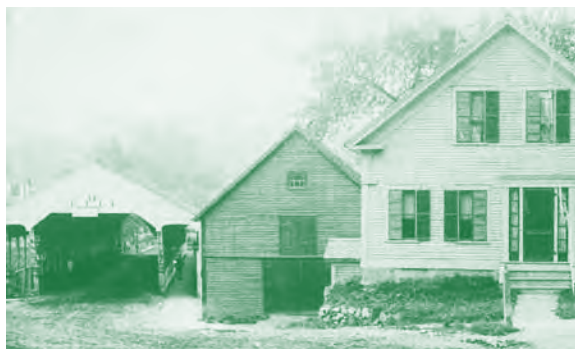
The covered bridge (at left) on the site of today's Veteran's Memorial Bridge. The sign warns of a $2.00 fine for galloping horses.

To complete your tour, walk across the VETERANS' MEMORIAL BRIDGE (24) . The first "Cottage Street Bridge" was erected here in 1810, and a covered bridge spanned the river from 1839 to 1894. By an act of the NH Senate, the present bridge was designated the Cottage Street Veterans' Memorial Bridge and dedicated on Memorial Day of 2003. It displays 47 plaques honoring Littleton veterans killed in action in America's wars from the Civil War to Operation Iraqi Freedom. Two other plaques recognize a Medal of Honor winner and 16 Littleton soldiers who perished from disease or other causes during the Civil War and World War I. The bridge—recognizing individual veterans from a single town—is purported to be the only of its kind in the nation. The Littleton VFW maintains