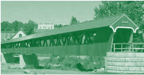
The state's newest covered bridge, the Riverwalk Covered Bridge, recalls the town's classic 19th century spans.

IN LITTLETON, THE PAST IS PROLOGUE, and Main Street proves that this town's future is shaped by a rich heritage. As the Littleton Chamber of Commerce observed in 1921: