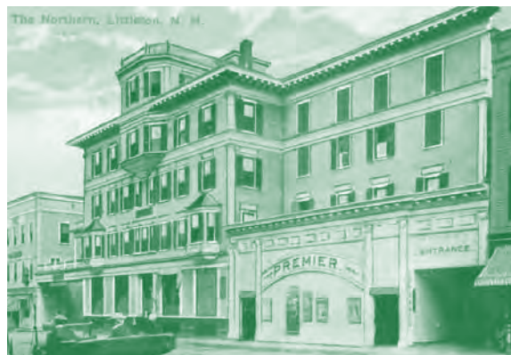
The Eames Block circa 1920s.