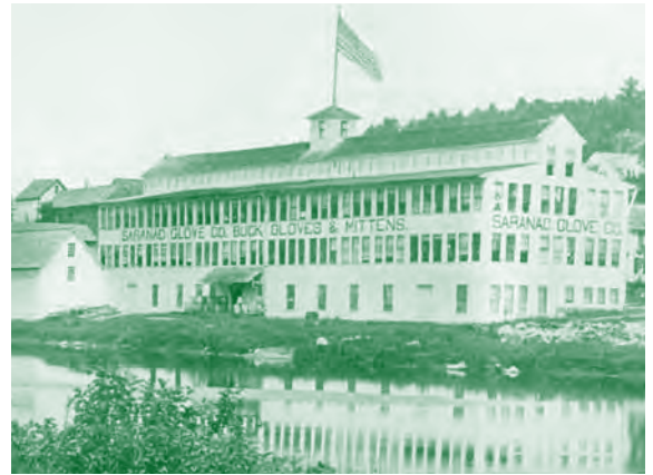
Saranac Glove Co., circa 1900.