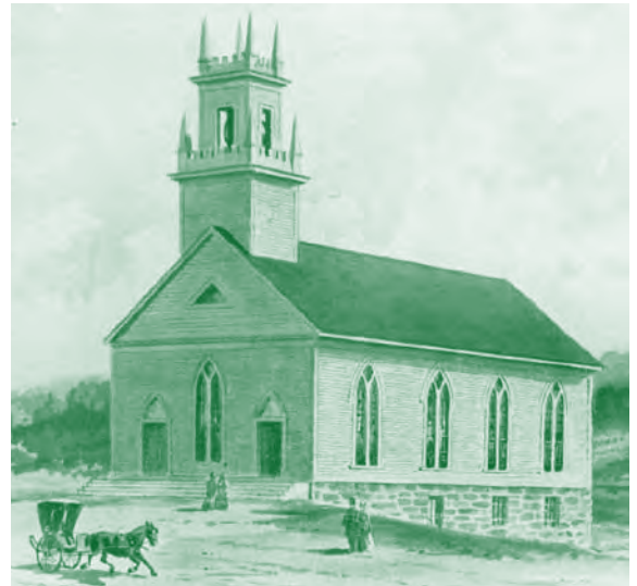
The original First Congregational Church, erected in 1832.

W hite settlers traveled up the Connecticut River and established two hamlets in the township on the Connecticut and Ammonoosuc Rivers where Native Americans had occupied seasonal fishing camps. Ammonoosuc means “narrow fishing river” in the Native American Abenaki language. The first meetinghouse (1815) was erected midway between the two settlements. (A plaque near Partridge Lake marks the site.) Because the Connecticut River was too broad and turbulent for primitive mills, settlers migrated to “Ammonoosuc Village,” where, in 1832, they built the FIRST CONGREGATIONAL CHURCH (1) on “Meetinghouse Hill.” They called the stormy Reverend Drury Fairbank (1772–1853) to the pulpit. During his pastorate, the church was irreverently