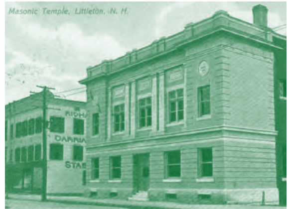
The Masonic Temple in 1911.

The diner’s neighbor to the east is the 1909 MASONIC TEMPLE (3) , the street’s sole example of Beaux Arts Classicism. Anti-Masonic sentiment delayed the establishment of a Lodge in Littleton until 1859. The Lodge was named for Dr. William Burns (1783–1868), the town’s second practicing physician. In 1865, members of the Burns Lodge built the Union Block, which stood between today’s Harrington and Chutter Blocks. They erected the present edifice on the site of the Union House, the village’s first (1826) tavern. It was financed by subscription and owned by a private society separate from the Lodge. The building’s disciplined symmetry was echoed years later in the design of the Public Library and the U.S. Post Office.