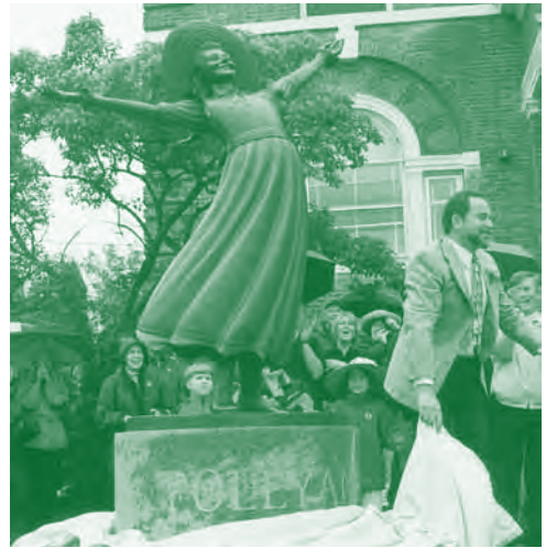
The unveiling of the Pollyanna sculpture in June, 2002.