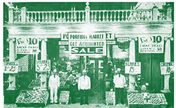
Porfido's Market, circa 1935.

Porter and oversees the use of Pollyanna of Littleton as a public attraction, cultural asset, resource, and positive inspiration for the community and others.” This sculpture was recognized as the state’s “Best Public Art” by New Hampshire Magazine in 2002. Few visitors can resist posing near the statue and imitating Pollyanna’s exuberant gesture for a keepsake photo. The Town fathers proclaimed for perpetuity the second Saturday in June as Pollyanna Day, a day of ceremonies that celebrate “gladness”.