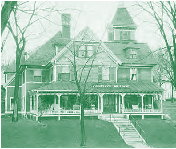
The Parker Mansion in the 1920s.